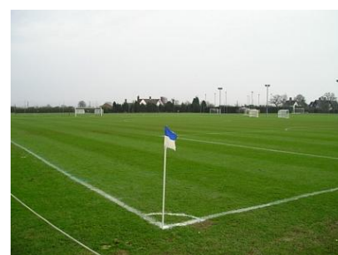
Ipswich Town Academy

Notts County CoE – 1200 - Anker Valley Sports Complex – B77 3AU