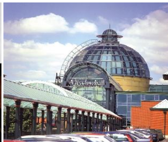
(Meadow Hall Sheffield)