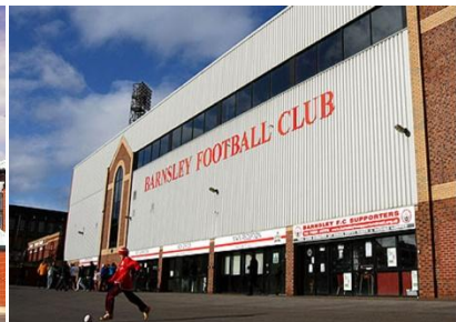
(Oakwell, Barnsley Football Club)